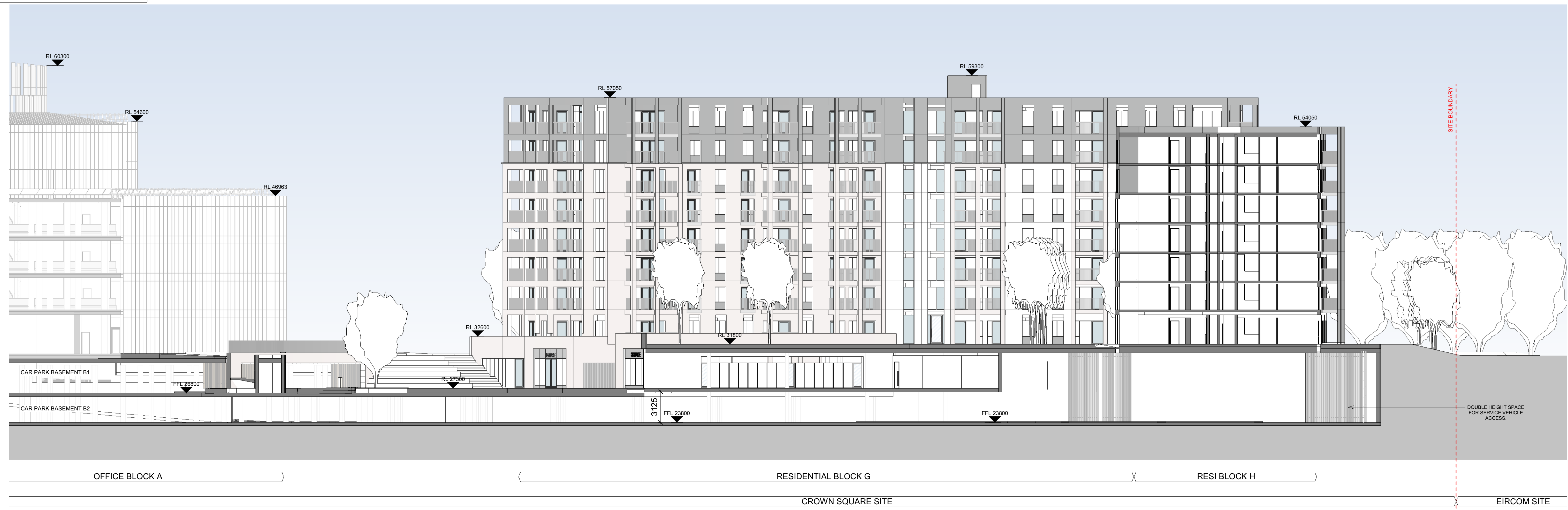
1 Site Section 9_1.200 1:200