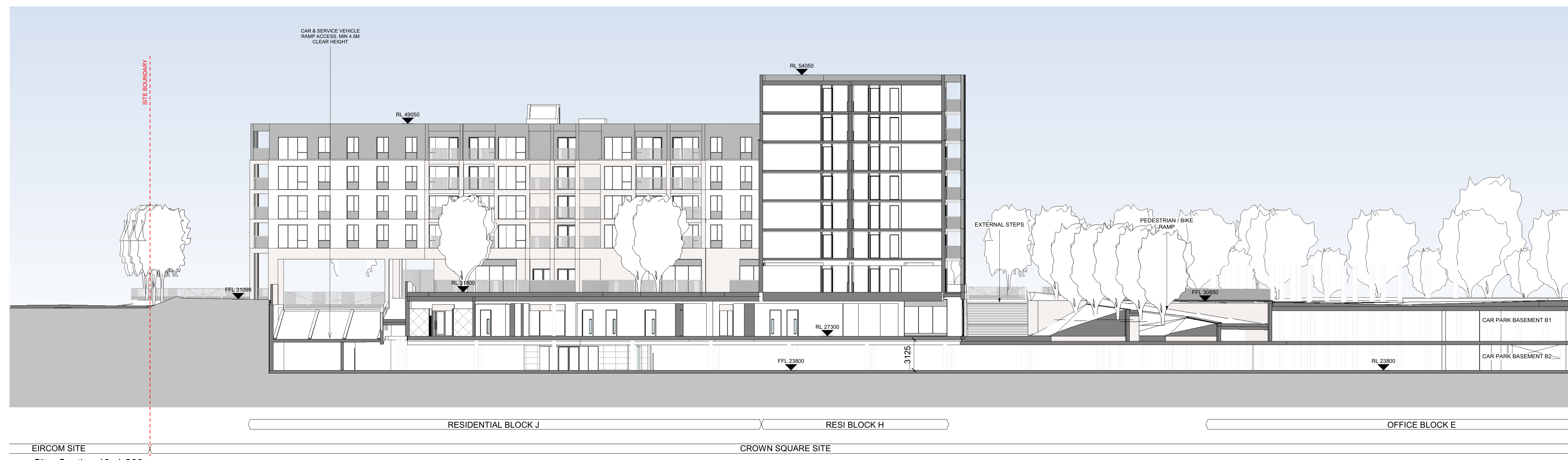
2 Site Section 10_1.200 1:200